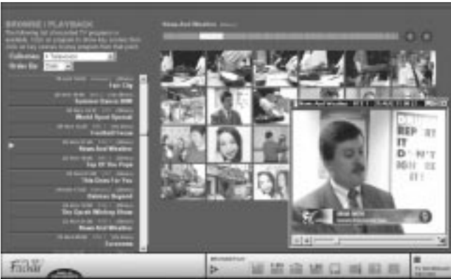
Fig. 1. Browse and playback in Físchlár

Once the visual index has been created it can be presented to the user in the browse/playback section of Físchlár. In the browse/playback section, the list of recorded programmes currently stored by the system is displayed. The user can browse this list by date, channel, category (i.e. genre) or personalised recommendation. Once a programme is selected for viewing, its visual index is presented to the user for further browsing at the level of shots or scenes. The visual index for each programme consists of a set of shot boundaries and associated keyframes, possibly grouped by scene or subject. A number of different interfaces has been developed, which allow a user to browse this visual index in order to locate video segments of particular interest (see section 4). Once such a segment has been located, the MPEG-1 bitstream for that part of the programme can be streamed to the user. An example of the browse/playback functionality of Físchlár is illustrated in Figure 1.